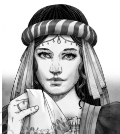
Desdemona Othello's wife