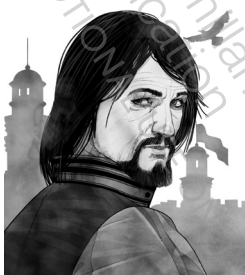
Iago Othello's standard-bearer