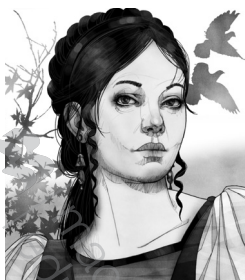
Emilia Iago's wife