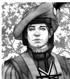
Cassio Othello's lieutenant