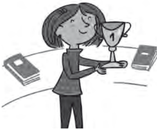
1 win a competition

a competition a language famous fit friends happy