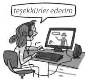
4 learn _____