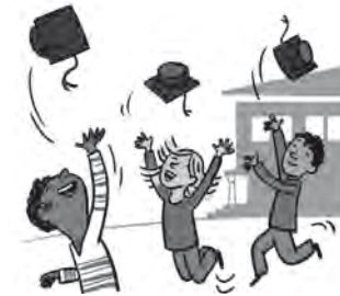
6 feel _____