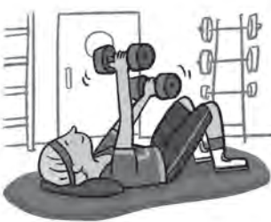
5 get _____