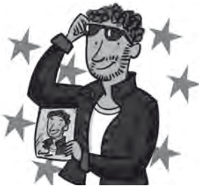
3 be _____