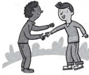
2 make _____