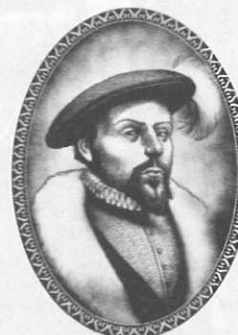
Lord Protector, Edward's uncle