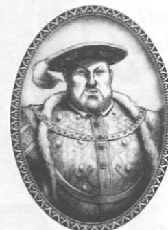
Henry VIII, Edward's father