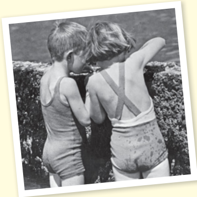
a family _____

c Listen again and number the photos in the right order.