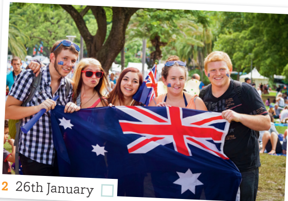
2 26th January