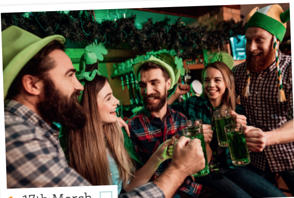
1 17th March

a Australia Day b St. Patrick's Day in Ireland c Canada Day d Independence Day in the US