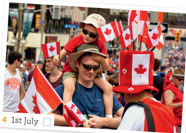
4 1st July