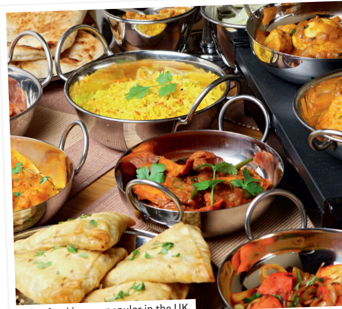
Indian food is very popular in the UK.