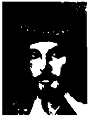
The Duke of Buckingham