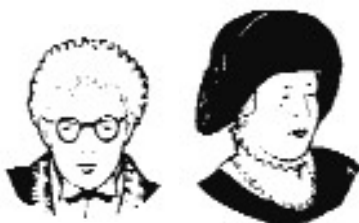
(d) Mr and Mrs St Clair

Have you read Rebecca by Daphne du Maurier? It is another Upper Intermediate Level Reader.